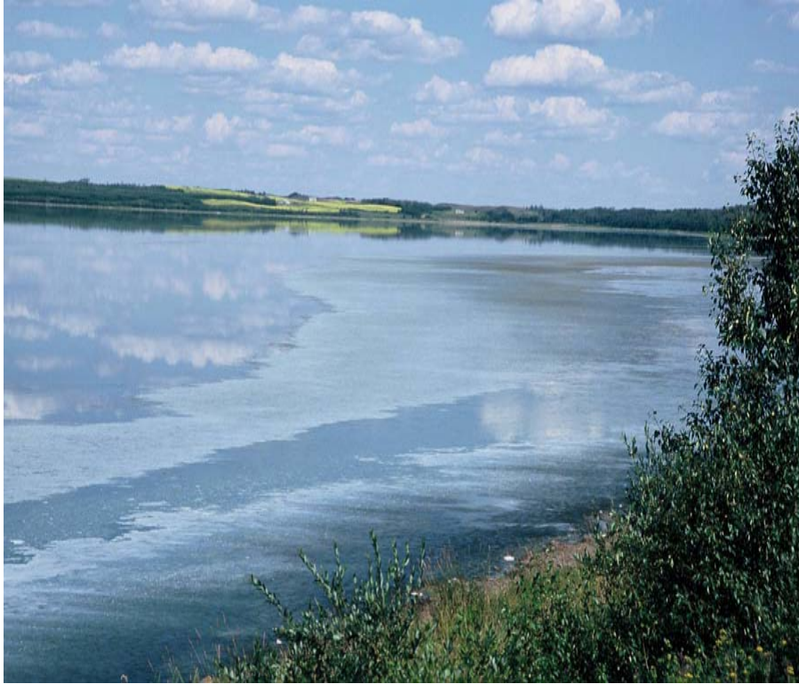
Saddle Lake, AB