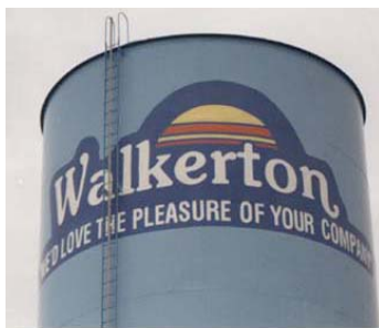
The Walkerton water tower, inviting business to locate in the town

However, this approach results in some serious problems. In developing countries, waterborne disease epidemics are common. Many people like to think that developed countries are safe from contaminated water. But, in 1993, the United States Environmental Protection Agency estimated that about 403,000 people became ill, and more than 100 people died, when Cryptosporidium contaminated the water supply in Milwaukee, Wisconsin. And, in 2000, E. coli contaminated the water supply in Walkerton, Ontario, causing seven deaths, and over 2000 illnesses. In North Battleford, Saskatchewan, in 2001, Cryptosporidium contaminated the water and was responsible for between 5800 and 7100 illnesses.