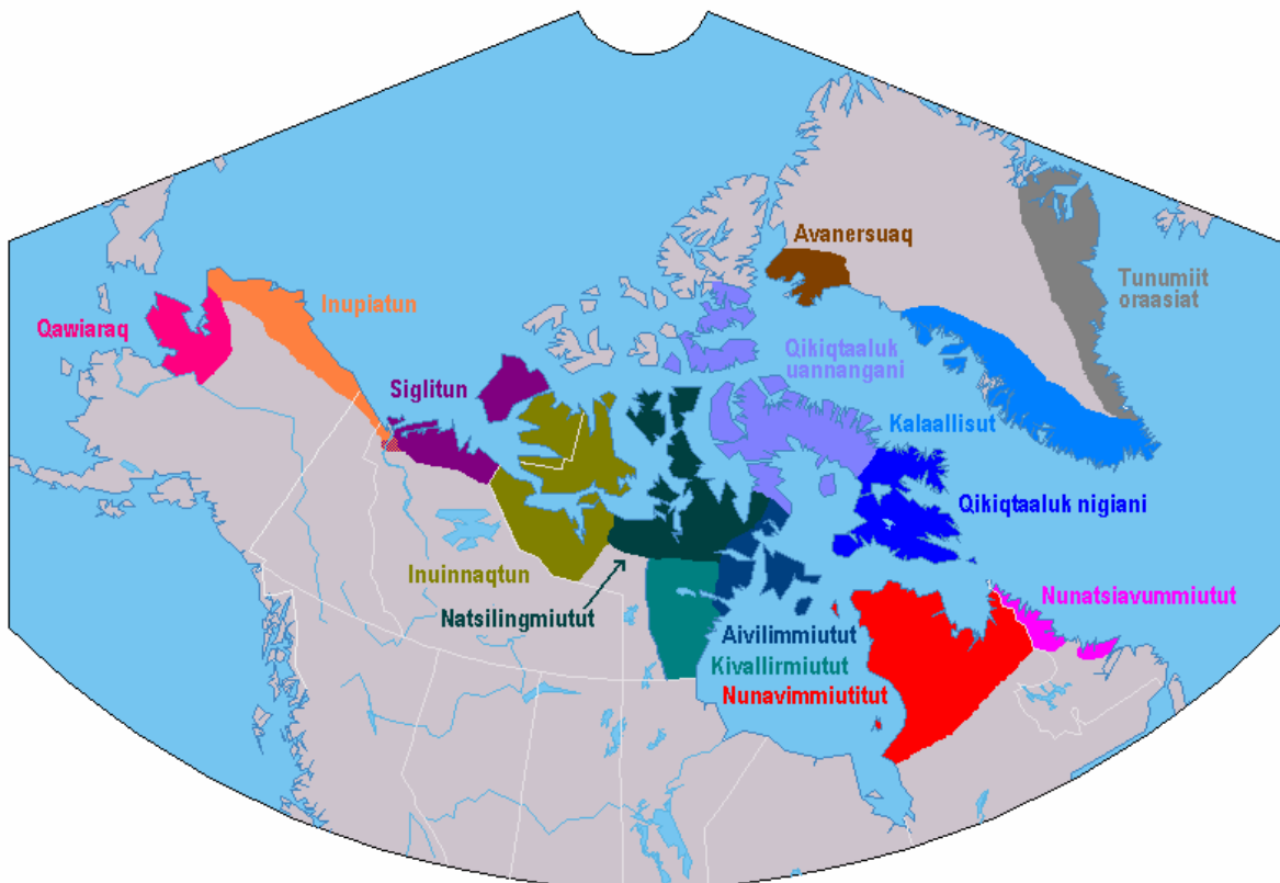
Regions of Canada in Which Various Inuktitut Dialects Are Spoken; http://en.wikipedia.org/wiki/Image:Inuktitut_dialect_map.png

This map shows the rough boundaries of the regions in which each dialect is spoken. It is difficult to accurately classify dialects and draw boundaries, because there are so many dialects, some with more similarities than others. Furthermore, there are some dialects that are essentially identical, though spoken in different regions.